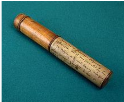
This early stethoscope belonged to Laennec. ( Science Museum, London )

First, we have to see principles of sound, echo, let's try how Lord Krishna is helpful for us